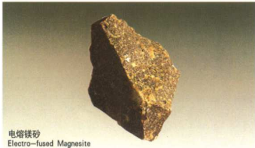
电熔镁砂 Electro-fused Magnesite

Website: www.lavadl.com Mail to: info@lavadl.com